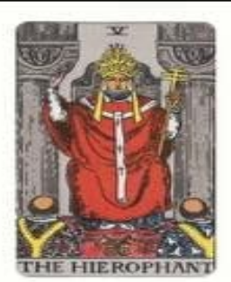
What lead to it ending