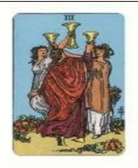
How it used to be

If you are currently struggling with romantic or platonic relationships, or the possibility of a new romance or maybe you've broken up with someone or you are looking back on a relationship, wondering if there is a chance of reconciliation this Tarot card spread can help.