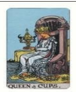
Significance of relationship