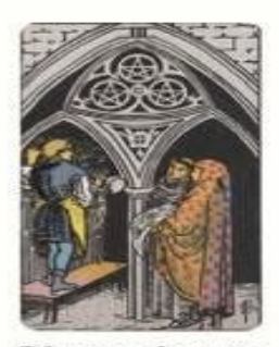
Obstacles to reconciliation