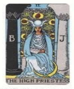
What your ex wants